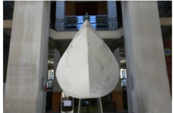
INSTANTS, CAUSSE, AGUA, ADM © Milène Guermont / ADAGP